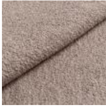
Barnum 3 Hemp 1025009