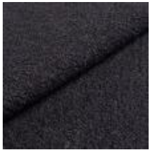
Barnum 19 Ocean 1025014