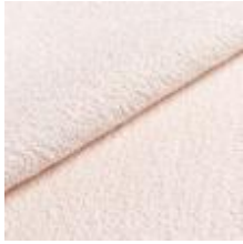
Barnum 24 Lana 1025015