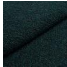
Barnum 20 Petrol 1025017