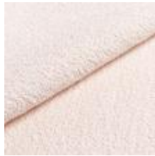
Barnum 24 Lana 1025015