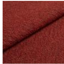
Barnum 23 Rust 1025016