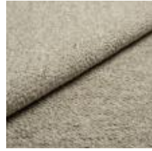
Barnum 2 Sand 1025012