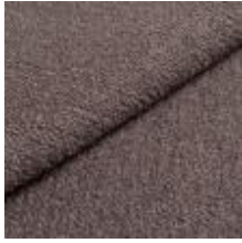
Barnum 12 Warm grey 1025002