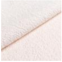
Barnum 1 Off white 1025001