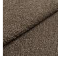
Barnum 8 Medium green 1025013