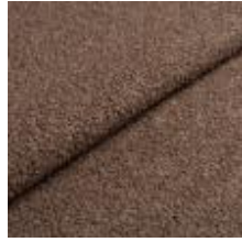
Barnum 10 Dark taupe 1025010