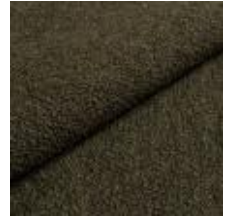
Barnum 9 Pine 1025007