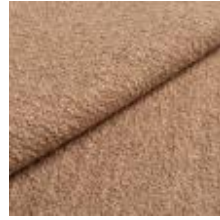
Barnum 4 Juta 1025011