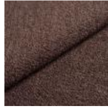
Barnum 11 Brown 1025005