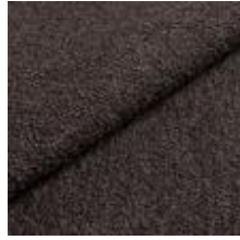
Barnum 13 Antracit 1025003