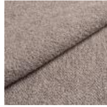
Barnum 14 Silver 1025006