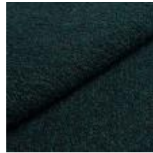
Barnum 20 Petrol 1025017