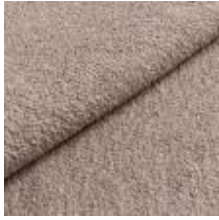
Barnum 3 Hemp 1025009