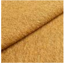
Barnum 5 Ocher 1025008