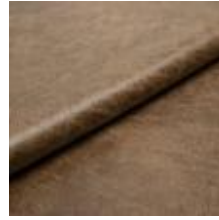
Rodeo 26 Desert 1028626