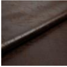
Rodeo 6 Java 1028606