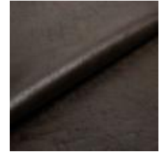
Rodeo 46 Tobacco 1028646