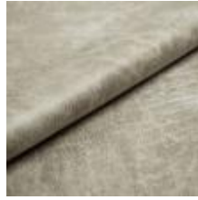
Rodeo 10 Ebony 1028610