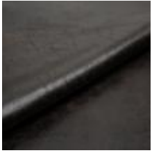
Rodeo 4 Night 1028604