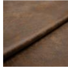
Rodeo 36 Cognac 1028636