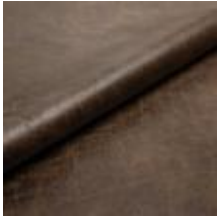
Rodeo 66 Umbra 1028666